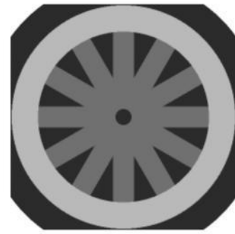
Figure 4. Image use for edge detection analysis

Edge detection was performed on the image shown in figure 4, this was done using Matlab and the four algorithms discussed above were all implemented on the image shown in figure 4.