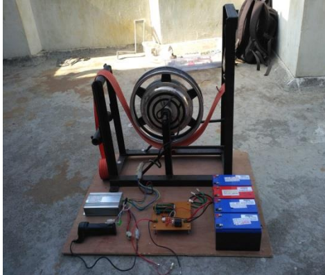
Figure 4. Experiment setup