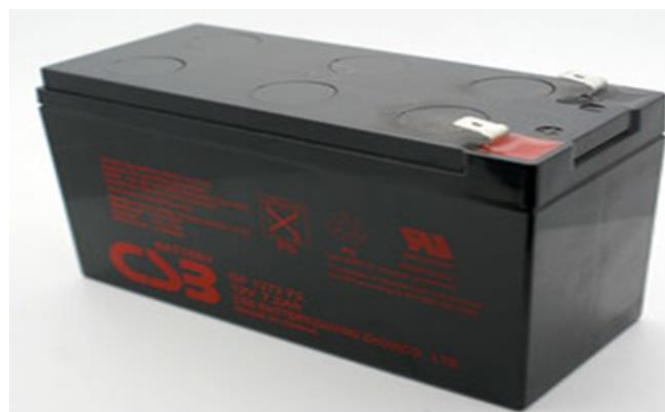
Figure 2. Lead-acid battrey

The higher the current flow faster the battery will discharge. A battery is rated in ampere-hours (abbreviated Ah) and this is called the battery capacity. This project revolves around supplying and utilizing energy within a high voltage battery. It demands for a battery with longer running hours, lighter weight with respect to its high output voltage and higher energy density. Among all the existing rechargeable battery systems, the lead acid cell technology is the most efficient and practical choice for the desired application. The battery chosen for this project was a high capacity lead acid battery pack designed specifically for vehicles. Plastic casing is provided to house the internal components of the battery.