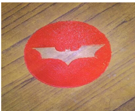
Figure 2. Batman Logo

3D models were built on the 3D printer. Finally we move towards our end product, after a few unsuccessful run and few minor adjustments, we successfully arrived at many different outcomes. The surface finish was considerably good, it is hard, the product is able to sustain many drops; showing it is strong enough for daily use. Let us now see some of the final products.