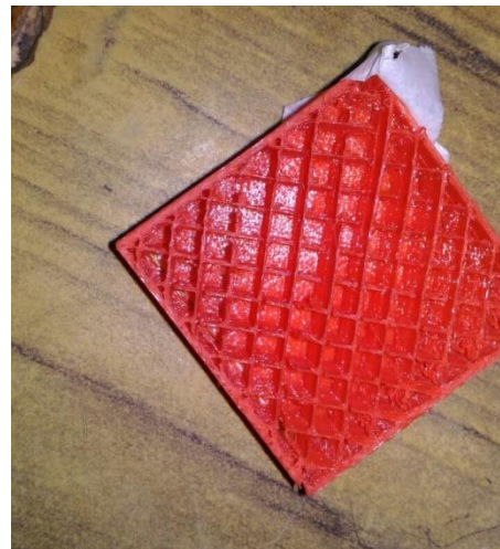
Figure 4. A Waffer Block

There are small defects as the whole setup was hand bluit, though the fact that cannot be ignored is that for a hand built prototype this type of final product and surface finish is pretty much acceptable.