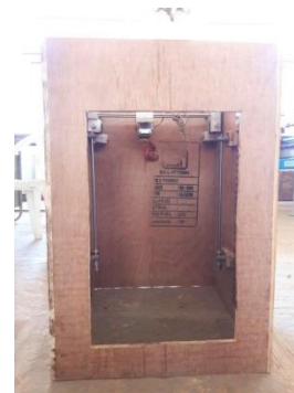
Figure 1. Assembled 3D printer

research paper to design and fabricate a low cost automation 3D Printer and build the 3D models of any shape or geometry.