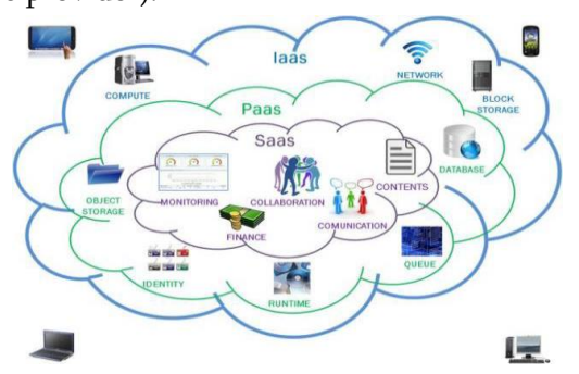
Figure 1. View of the Cloud Computing Environment

Cloud computing is an emerging technique; it provides services to its clients in on demand basis. It provides different services to its clients like Infrastructure-as-Service (Iaas), Platform-as-Service (Paas), Software-as-Service (Saas) in a virtualized environment. Iaas provides different services including data storage space, access to network features and also computers (both virtual or on dedicated hardware), Paas provides platform which allow the client to focus on the deployment and management of the applications. Saas is also referred as end-user applications, it provides a completed product that is run and managed by the CSP (cloud service provider).