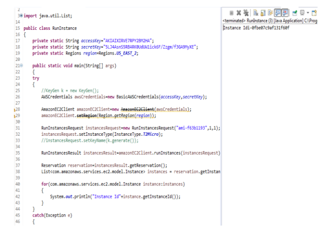
Figure 3. VM creation