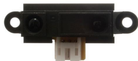
Fig.2 Proximity sensor

A proximity sensor often emits an electromagnetic field or a beam of electromagnetic radiation (infrared, for instance), and looks for changes in the field or return signal. The object being sensed is often referred to as the proximity sensor's target.