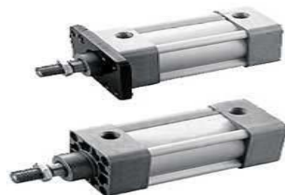
Fig. 1 Pneumatic Cylinders

The electro-pneumatic action is a control system for pipe organs, whereby air pressure, controlled by an electric current and operated by the keys of an organ console, opens and closes valves within wind chests, allowing the pipes to speak. This system also allows the console to be physically detached from the organ itself. The only connection was via an electrical cable from the console to the relay, with some early organ consoles utilizing a separate wind supply to operate combination pistons.