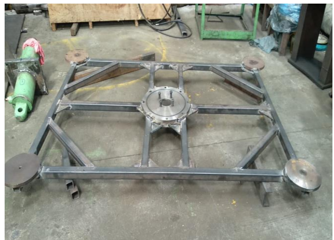
Fig. 3.1: Lifting Frame

The primary purpose of a structure is to transmit or support loads. If the structure is improperly designed or fabricated, or if the actual applied loads exceed the design specifications, the device will probably fail to perform its intended function, with possible serious consequences. A well-engineered structure greatly minimizes the possibility of costly failures.