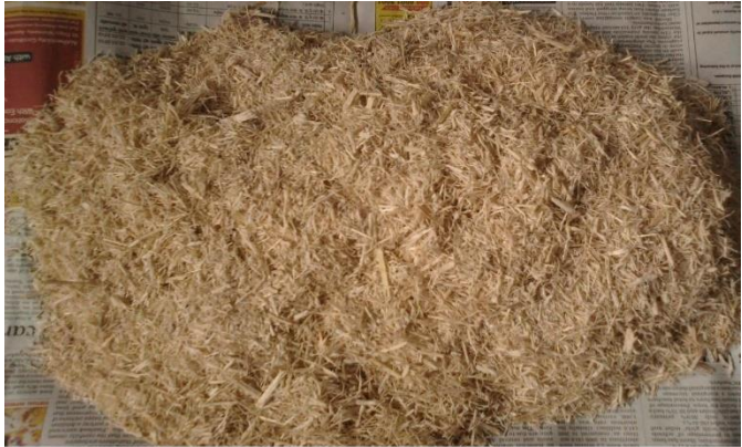
Fig 1.2 : BAGASSE

Visualizing the increased rate of utilization of natural fibers the present work has been undertaken to develop a polymer matrix composite (epoxy resin) using bagasse fiber and fly ash as reinforcement and to study its mechanical properties and environmental performance. The composites are to be prepared with different fraction of bagasse fibers.