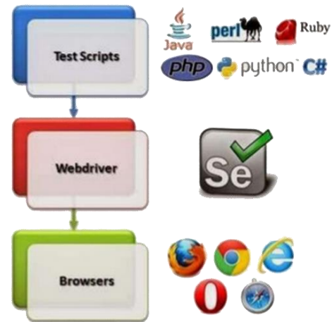
Figure 1 : Selenium Webdriver Workflow

The Data driven testing is creation of test scripts to run together with their related data sets in the framework. The framework contains some main components; they are ANT script, Reusable Library, Library Files, Logger, Test Data, Test Report, Test Screens, Test Scripts, and Test Suite.