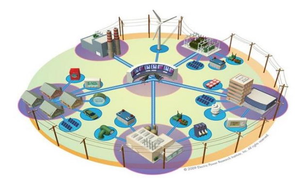
Figure 3: Distributed generation

Distribution generation takes place in two levels – local level & the end point level. Local level power generation include renewable energy technologies. They are efficient, reliable, cost effective & cause less environmental damage. On distribution generator technology employed by end point users is the modular combustion engine. These can be used as a backup to RVs & home.