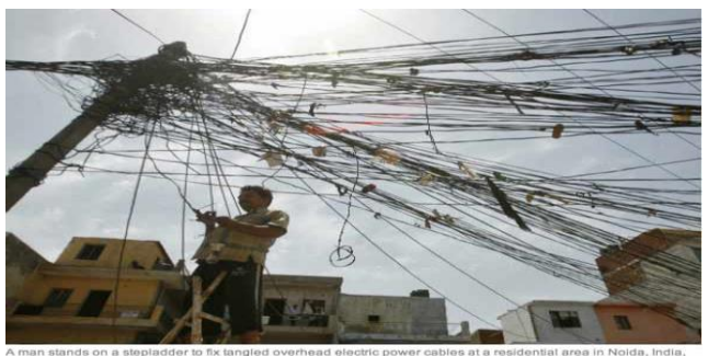
A man stands on a stepladder to fix tangled overhead of June 1, 2011.

Figure 1: A man standing on a step ladder to fix tangled overhead electric power cables at a residential area in Noida, India