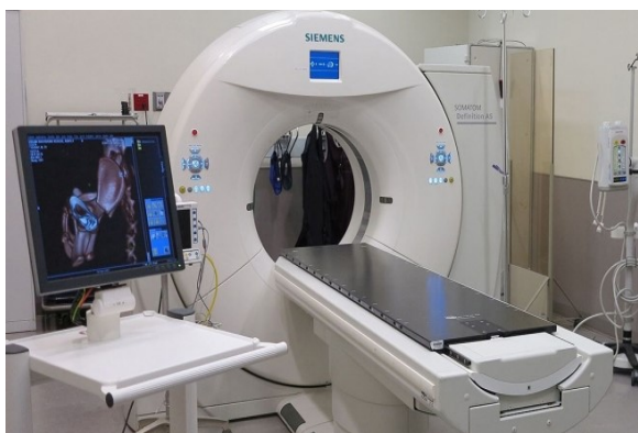
Figure 1. CT Scanner