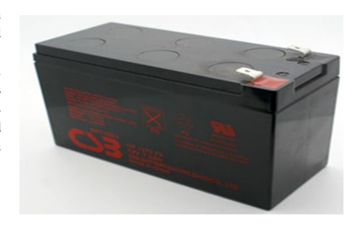
Figure 2. Lead-acid battreY

The higher the current flow faster the battery will discharge. A battery is rated in ampere-hours (abbreviated Ah) and this is called the battery capacity. This project revolves around supplying and utilizing energy within a high voltage battery. It demands for a battery with longer running hours, lighter weight with respect to its high output voltage and higher energy density. Among all the existing rechargeable battery systems, the lead acid cell technology is the most efficient and practical choice for the desired application. The battery chosen for this project was a high capacity lead acid battery pack designed specifically for vehicles. Plastic casing is provided to house the internal components of the battery.