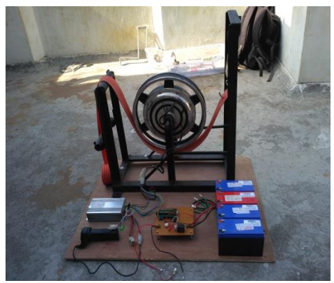
Figure 4. Experiment setup