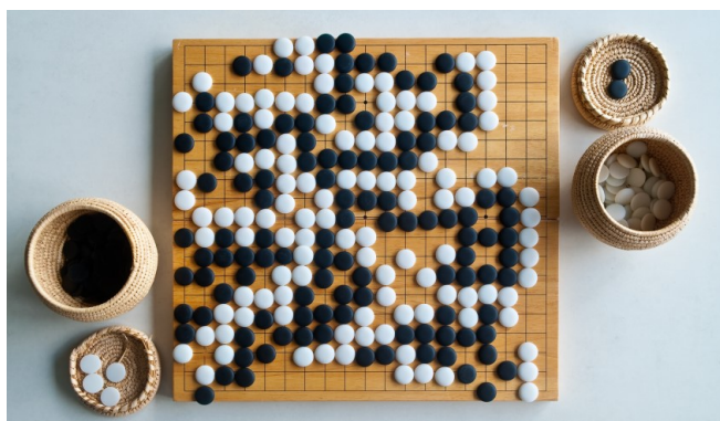
Figure 3: Chinese Ancient Board Game “Go”

AlphaGo is an AI based machine developed by Google DeepMind. It created a history in the recent months by defeating the world champion of Chinese ancient board game “Go”. The world champion of board game, Lee Sedol of South Korea was challenged by Google DeepMind to five board game series in which AlphaGo defeated the champion by four to one. AlphaGo proved that machines can be made intelligent enough to defeat human brain. They can learn from the environment and can predict more accurately than a human brain can. They can make decisions more quickly and accurately than what is expected from human mind.