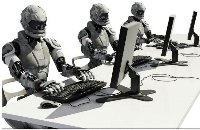
Figure 2: Image from www.shutterstock.com