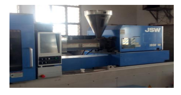
Figure 2. Injection Moulding Machine: JSW 180H