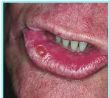
Ulcers are painful sores that appear in the mouth.