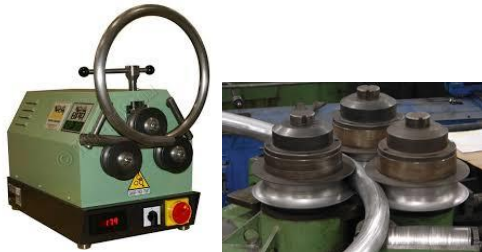
Figure 2. Pipe bending machine