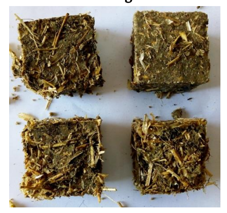
Figure 3. Briquette of ChanaAgriwaste