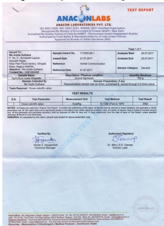
Figure 4. Test Report of ChanaAgriwaste