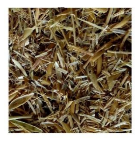
Figure 7. Briquette of Wheat Agriwaste