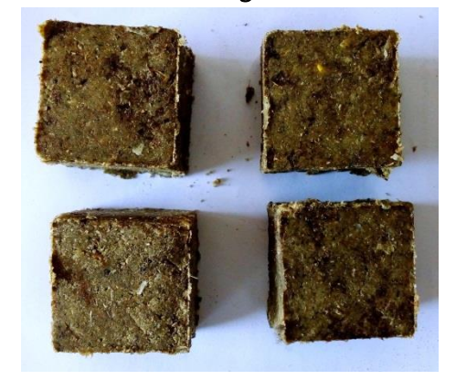
Figure 5. Briquette of Rice Agriwaste