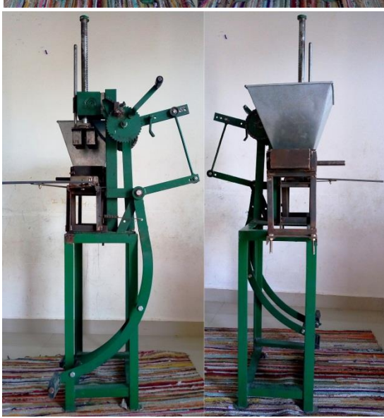
Figure 2. Actual Produced Agriwaste Briquette