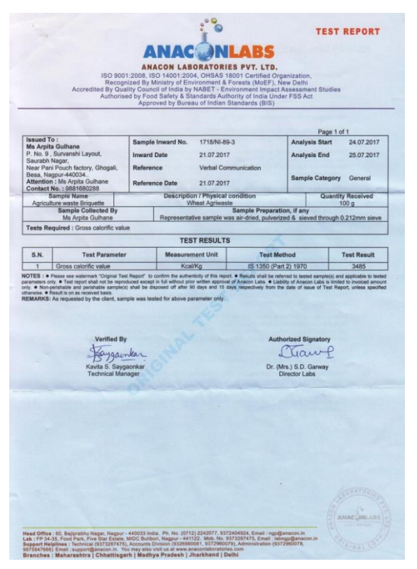
Figure 8. Test Report of Wheat Agriwaste