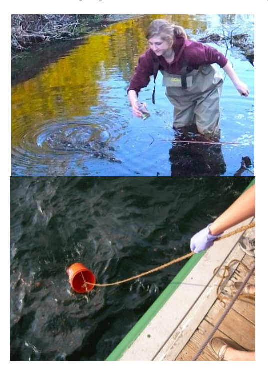
Figure 4: Grab sampling method used to collect water sample

place) at one time, as the sample should be collected carefully and proper way to prevent mixing with foreign materials. If water is collected in a bucket, the sample will be placed in plastic bottle or glass bottle sample that have been devoted to water samples (figure 5). If the water sample will not be analyzed at the same time and day, the water sample will need to be preserved using acid to reduce the activeness rate of organic microorganisms in water samples, for example sulfuric acid (H<sub>2</sub>SO<sub>4</sub>) or nitric acid (HNO<sub>3</sub>). This river water sample will be taken directly to the laboratory for analysis to obtain the results.