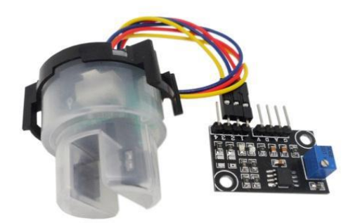
Figure 1. Turbidity Sensors.

The turbidity sensor used to detection of Suspended particles in water by measuring the light Transmittance.