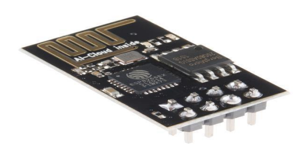
Figure 4. Wi-Fi module.

After all the parameters are connected and checked the information has to be sent through Wi-Fi module online so that it can be monitored remotely. For this purpose, Wi-Fi module is used. It helps us make this system real time.