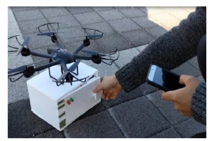
Figure 3. Lock function by app

Performing of Lock function - As appeared in [Figure 3], enter the secret word gave by the executive through the cell phone application in the crate before the automatons withdraw for the beneficiary and press the bolt catch to play out the bolt. Right now, arduino is introduced in the crate, which controls the client's cell phone and Bluetooth work.