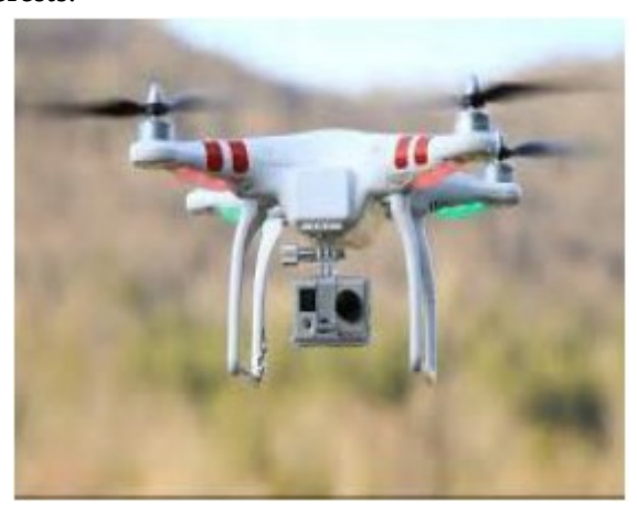
Figure 1. Heli-cam shooting by Drone

additionally been effectively created and examined. There are additionally numerous things that have been created and popularized as individual side interests.