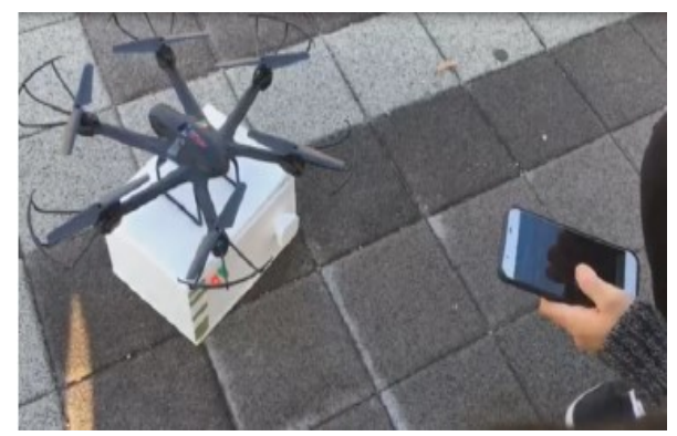
Figure 6. Receipt of goods

Receipt of goods - As shown in [Figure 6], when the delivered drones arrive at the recipient, the recipient's smartphone application enters the password of the item box and unlocks the item.