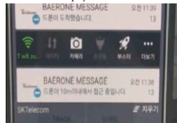
Figure 5. Push Alarm of Arrival

Push Alarm of Drone Arrival - As shown in [Figure 5], if the drones are approaching the sender and the recipient within a certain distance, a push alarm will be displayed to inform the user of the approach and a push alarm will be displayed to inform arrival.