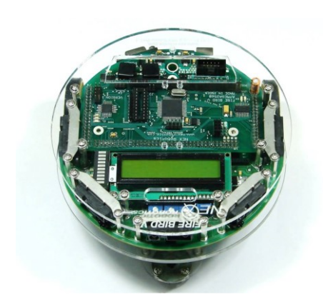
Figure 1. Firebird V Atmega 2560 Platform

Master: P89v51RD2 Slave: ATmega2560 Master: ATmega 2560 Slave: ATmega 8 Master: LPC 2148 Slave: 2 x ATmega 8