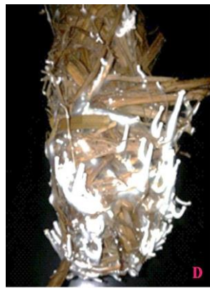
Figure 1. Cultivation of Volvariella bombycina using circular bed method