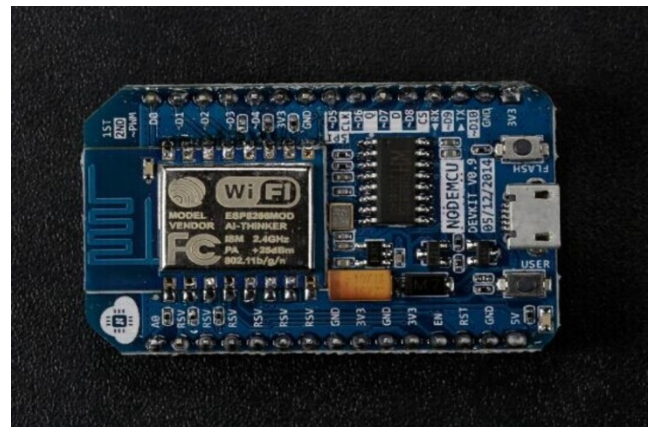
Figure 3. The NodeMCU DEVKIT board3

Arduino and Raspberry Pi do not have built-in support for wireless networks. Developers will have to add a wifi or cellular module to the board and write code to access the wireless module. So open source IoT development board called NodeMCU is used[7] and allows you to code your device using Lua scripts. One of its most unique features is that it has built-in support for wifi connectivity. It is a very inexpensive System-on-a-Chip (SoC) called the ESP8266. The ESP8266, designed and manufactured by Espressif Systems, contains all crucial elements of the modern computer: CPU, RAM, networking (wifi), and even a modern operating system and SDK. This makes NodeMCU a smart choice to play with the IoT.