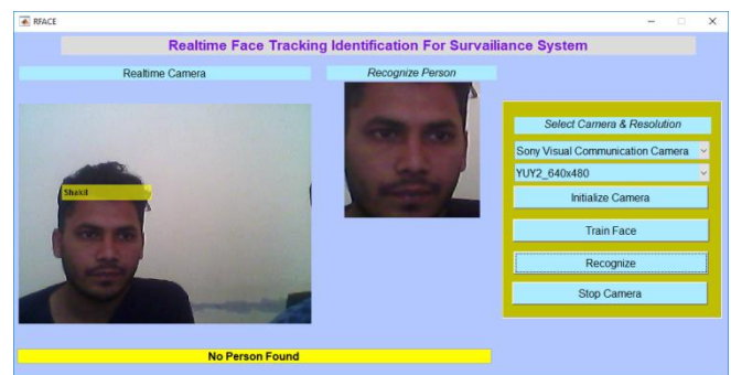
Figure 3. GUI Running