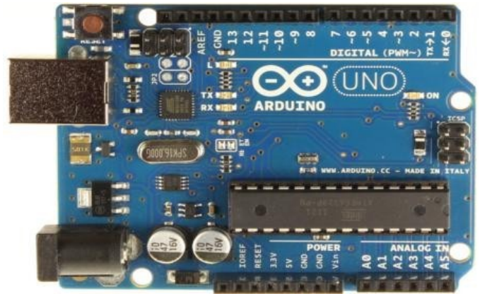
Fig.3. Arduino Uno

The ArduinoUno is a microcontroller board based on the ATmega 328. It has 14 digital input/output pins (of which 6 can be use as PWM outputs), 6 analog input, a 16MHz ceramic resonator, a USB connection, a power jack, an ICSP header, and a reset button. It contains everything needed to support the micro controller, simply connect it to a computer with a USB cable or power it with a AC to DC adapter or a battery to get started. The UNO differs from all preceding boards in that it does not use the FTDI USB- to- serial driver chip. Instead, it features the ATmega16U2(ATmega8U2 upto version R2) programmed as a USB-to-serial converter. TO ENSURE A HIGH-QUALITY PRODUCT, DIAGRAMS AND LETTERING MUST BE EITHER COMPUTER-DRAFTED OR DRAWN USING INDIA INK.