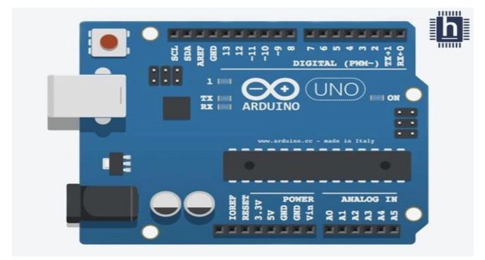
Figure 1. Arduino Uno

The Arduino Uno is one of the most popular microcontrollers in the industry. It is user convenient and easier to handle. The coding or programming of this controller is also easy. The program is deemed volatile due to the flash memory technology. The microcontroller has wide range of applications used in many huge industries. It is used in security, remote sensors, home appliances and industrial automations. The device has capabilities to be connected the internet and act as a server too, this way the handling of information and data.