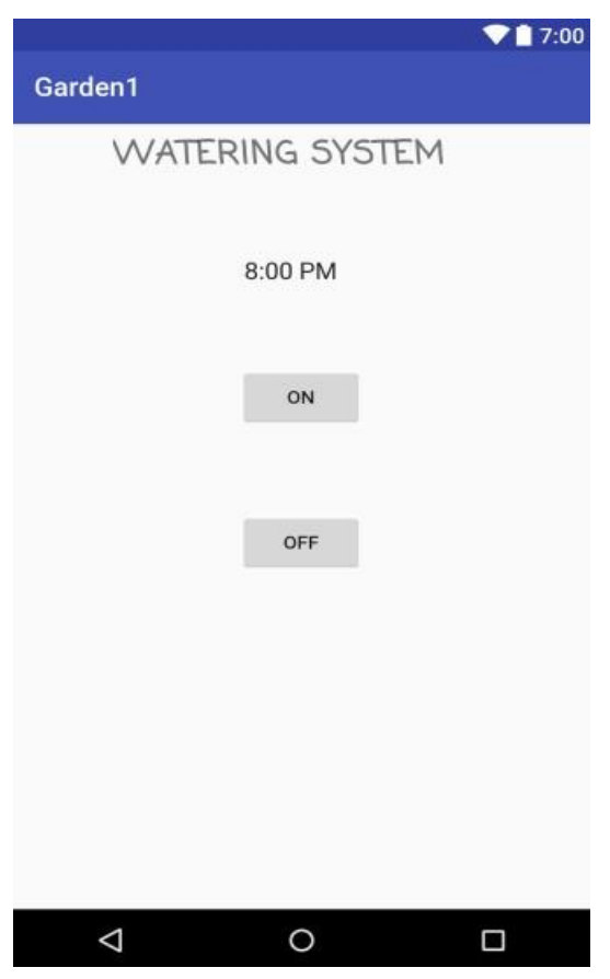
Figure 5. Android application