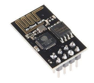
Figure 4. ESP8266(Wi-fi Module)

The ESP 8266 is a low cost wi-fi module which is used for interne interfacing for microprocessors. The ESP 8266 has a 64 KiB of instruction RAM and 96 KiB of data RAM.