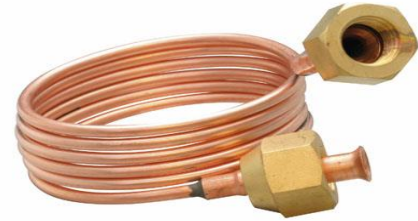
Fig. 1.1 Capillary Tube [3]

A capillary tube having long length approximately from 1.0 m to 6.0 m and narrow tube of constant diameter. Typical tube diameters of refrigerant capillary tubes range from 0.5 mm to 3 mm.