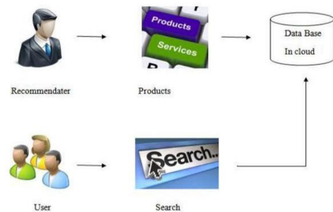
Figure 3. System Architecture

3. All as trusted users: With the same assumption, the influence of all trust neighbors in the manner of trusted users may be designed. However, since user-feature matrix P plays a key role in bridging both rating and trust information, the rating prediction.