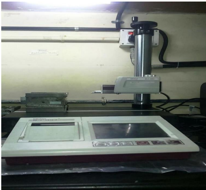
Figure 3 : ALEX H310 Series surface grinding machine