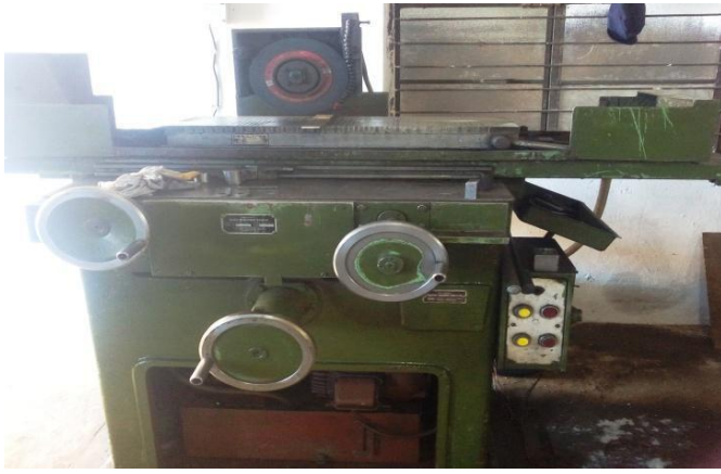
Figure 2: ALEX H310 Series surface grinding machine