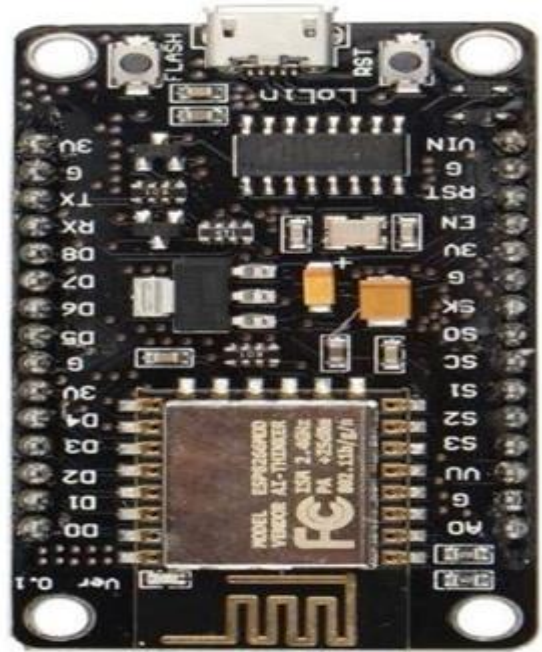
Fig.2 NODE-MCU (ESP8266)

Node MCU is an open source IOT platform. It includes firmware which runs on the ESP8266 Wi-Fi SOC from Express if Systems, and hardware which is based on the ESP-12 module. The term "Node MCU" by default refers to the firmware rather than the development kits. The firmware uses the LUA scripting language. It is based on the LUA project, and built on the Express if Non-OS SDK for ESP8266. It uses many open source projects, such as LUA-CJISON and SPIFFS.