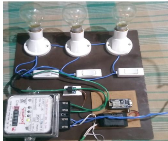
Fig. 5 Proposed model

output terminal of Node MCU. When we give supply to the energy meter. It transfer to the load through the output terminal passing through the current sensor. This current sensor senses the current that passes through the wire and gives it to the Node MCU. By Node MCU we connected to the Blynk app interfaces. It is IOT platform used to control Arduino, Node MCU. In Blynk app create a new project file name is IOT based smart energy meter. A page is appear hence we create a valued display settings to display the how much load we consume and a labeled value display it will display the cost of power consumed by the load in one month and last finally we insert a notification bar in a Blynk app for when the load is access then the threshold value it send notification alert to the Mobile through the Wi-Fi module of Node MCU.