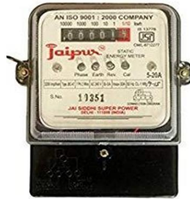
Fig.1 Energy Meter

Energy Meter” addresses the problems faced by both the consumers and the distribution companies. The paper mainly deals with smart energy meter, which utilizes the features of embedded systems i.e. combination of hardware and software in order to implement desired functionality. The paper discusses comparison of Arduino and other controllers, and the application of GSM and