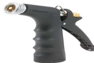
Fig: 2.4 Control Trigger

It's a nozzle or wand fitted to the end of your hose and that you control with a trigger. You must depress the trigger continuously by hand or lock it in the 'on' position for water to flow. Some models have a discreet switch that can be turned off with a single hand movement.