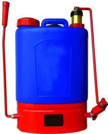
Fig: 2.1 Pesticide Tank

Tank is device which is used for storing the liquid and solid pesticides. It is rectangular and circular in shape. The size of the tank is selected according to the amount of pesticides used in the tank for spraying. It can used in either agricultural purpose and home appliances.