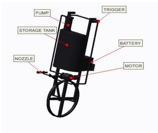
Fig: 3.1 Design Diagram