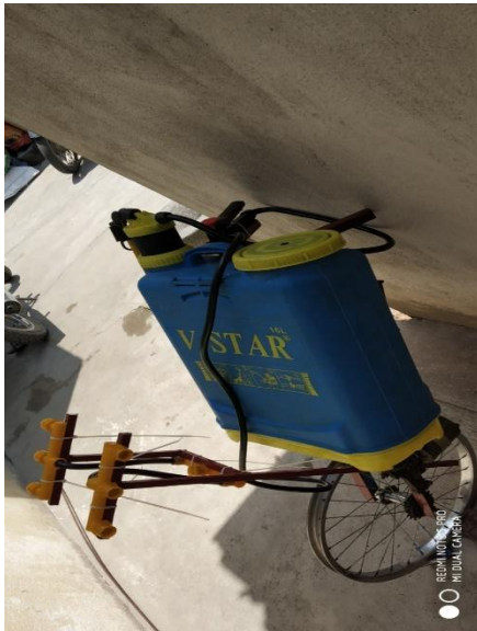
Fig: 7.1 Photography