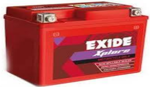
Fig: 3.4 12v Battery

For this machine there is a need for the rechargeable battery, so lead-acid battery used here. It occurs the energy through the electric power. Then it accumulate and stores the energy which is utilised to run the machine. After the draining of battery, it gets recharged and reutilised as in the form of cyclic manner.