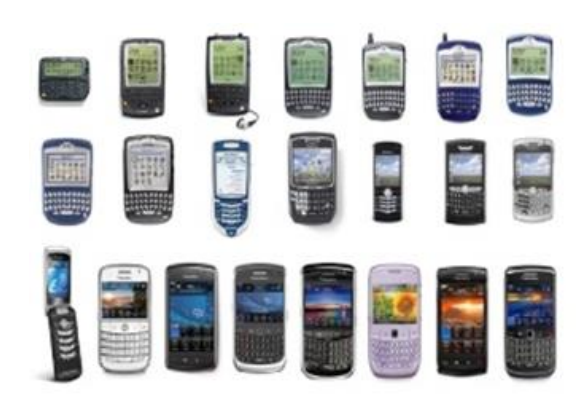
Figure 5: 4G Technology

wireless frequencies couple of years back. The word "MAGIC" also refers to 4G wireless technology which stands for Mobile multimedia, Any-where, Global mobility solutions over, integrated wireless services. The emergence Customized new technologies in the mobile communication systems and also the ever increasing growth of user demand have triggered researchers and industries to come up with a comprehensive manifestation of the up-coming fourth generation (4G) mobile communication system. 4G refers to the fourth generation of cellular wireless standards [5]. It is a successor to 3G and 2G families of standards [6]. The nomenclature of the generations generally refers to a change in the fundamental nature of the service, non-backwards compatible transmission technology and new frequency bands. The first was the move from 1981 analogue (1G) to digital (2G) transmission in 1992. This was followed, in 2002, by 3G multi-media support, spread spectrum transmission and at least 200 kbit/s, soon expected to be followed by 4G, which refers to all-IP packet-switched networks, mobile ultra-broadband (gigabit speed) access and multi-carrier transmission.