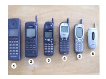
Figure 3: 2G Technology

Some benefits of 2G were Digital signals require consume less battery power, so it helps mobile batteries to last long. Digital coding improves the voice clarity and reduces noise in the line. Digital signals are considered environment friendly. The use of digital data service assists mobile network operators to introduce short message service over the cellular phones. Digital encryption has provided secrecy and safety to the data and voice calls. The use of 2G technology requires strong digital signals to help mobile phones work. If there is no network coverage in any specific area, digital signals would be weak.