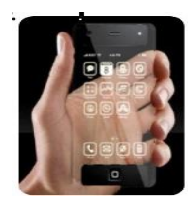
Figure 6: 5G Technology