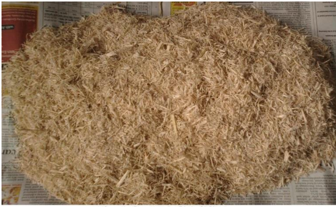
Fig 1.2 : BAGASSE

Visualizing the increased rate of utilization of natural fibers the present work has been undertaken to develop a polymer matrix composite (epoxy resin) using bagasse fiber and fly ash as reinforcement and to study its mechanical properties and environmental performance. The composites are to be prepared with different fraction of bagasse fibers.