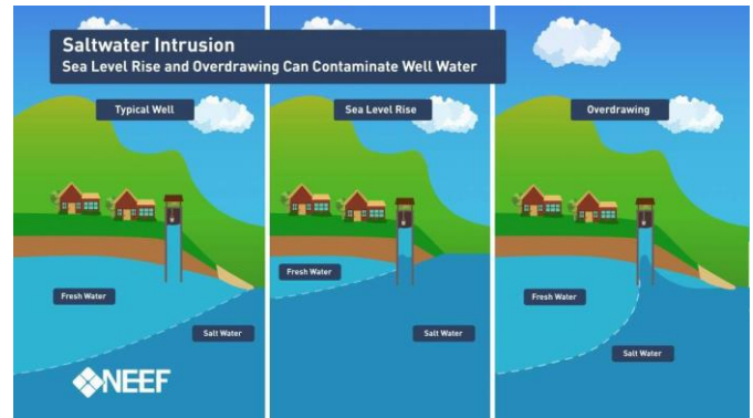
Figure 2. Salt-water from a well due to over pumping