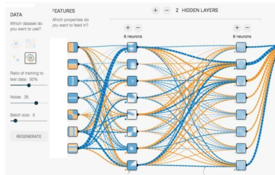
Figure 3. No. of hidden node (j) and No. hidden layers (k) Vs the prediction accuracy

The number of hidden layers and number of nodes are adjusted for comparing the best performance configuration (Figure 2.). By adapting different calculation factor and element, such as hidden nodes, hidden layer and learning rate and so on, accuracy up to 90% was achieved.