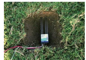
Fig3 Soil Sensor