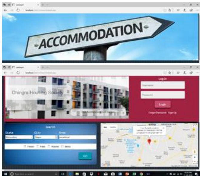
Fig 2 : Home Page

APIs to help the users find their location and the location of the facility they want to use. By giving the location of users, they can track the path needed to get to the respective facility.