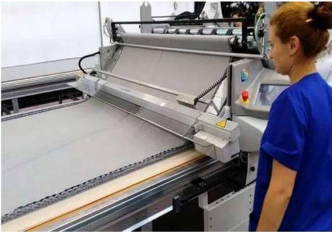
Fig.2. auto mated fabric spreading

Automation in Fabric Cutting : This process was also done manually earlier but now automatic fabric cutting machine is being used. As a result, it is possible to cut the fabric more accurately and smoothly than before. According to the design of the garment now the design of that pattern is saved directly in the computer memory without making marker paper and according to that instruction the cutting machine automatically cuts multiple layers of fabric together, in a short time and accurately. This cutting process is also done somewhere using laser. The use of automatic cutting machines has reduced both the number of workers and the time compared to manually or operator operated machines.