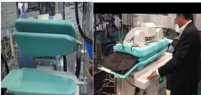
Fig.6. Full automatic ironing machine

Automation in Pressing : Pressing is one of the important steps to enhance the aesthetics of the product before going to the customers. Pressing operation is done to remove any crease in the garment so that it looks attractive when the customer buys it. Finding and retaining skilled workers for pressing operations is always a challenging affair. Operators migrate to other sectors for higher salaries when they gain sufficient skills. As a result, there is a shortage of skilled workers in this sector. These problems can be solved by adopting automation strategies in the pressing sector. Several advanced technologies such as pressing robots, jacket finishers, shirt finishers and shirt pressers are being commercially available now.