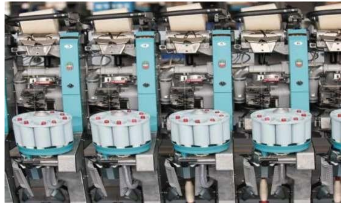
Fig. 1. Robotic auto coner

better opening of the yarn ends and a more favourable overlap in splicing zone.