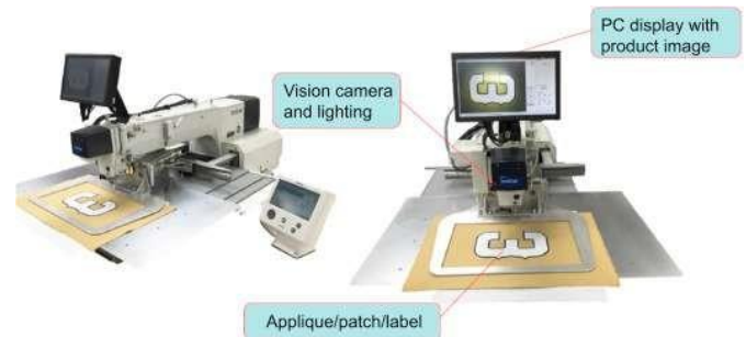
Fig.4. Computerized Sewing

equipment are facing extreme competition to keep labour costs low. Recently for the automation of the sewing process, industrial robots are being built that can handle fabric during sewing activities, where no labour will be required. The process of forming seam in these automatic machines is similar to that of traditional sewing machines. Different types of sewing stitches such as overlock stitch, double chain stitch, double lock stitch etc. can be formed by robotic sewing machine.