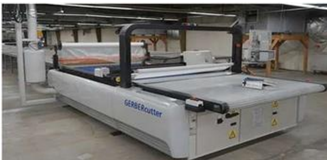
Fig.3. automated fabric cutting

Automation in Fabric Cutting : This process was also done manually earlier but now automatic fabric cutting machine is being used. As a result, it is possible to cut the fabric more accurately and smoothly than before. According to the design of the garment now the design of that pattern is saved directly in the computer memory without making marker paper and according to that instruction the cutting machine automatically cuts multiple layers of fabric together, in a short time and accurately. This cutting process is also done somewhere using laser. The use of automatic cutting machines has reduced both the number of workers and the time compared to manually or operator operated machines.