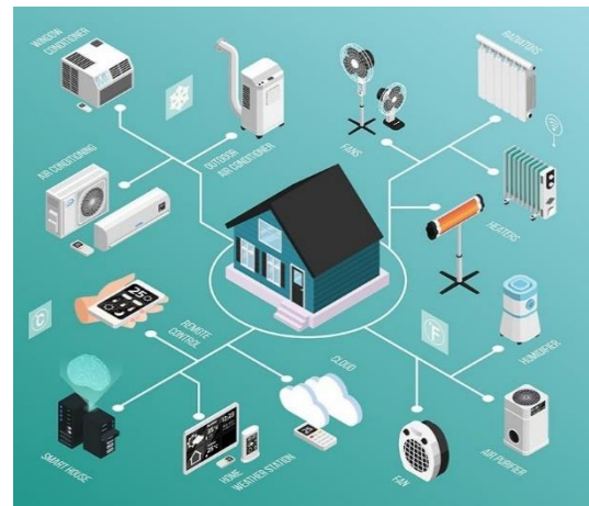
Figure 1: Internet of Things

Perception layer has real-time appliances such as Camera, pen drive, sensors etc. Data is sent to the next layer from the perception layer. Network layer is the middle layer that acts as a connection between physical world and virtual world. Application layer is the application developed for smart homes, cities, smart agriculture and e-Health. This layer is the client end layer where the user gets information according to which the user can control the appliances.