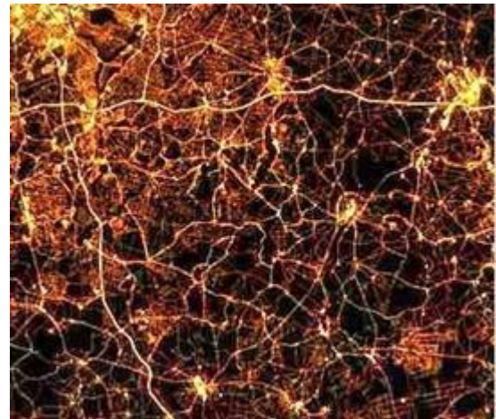
Figure 6. Enhanced Image