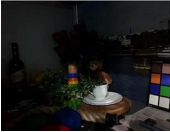
Figure 7: Input Image