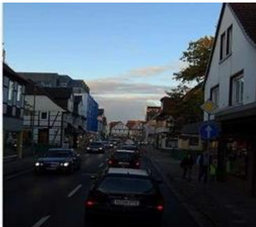
Figure 3. Input image