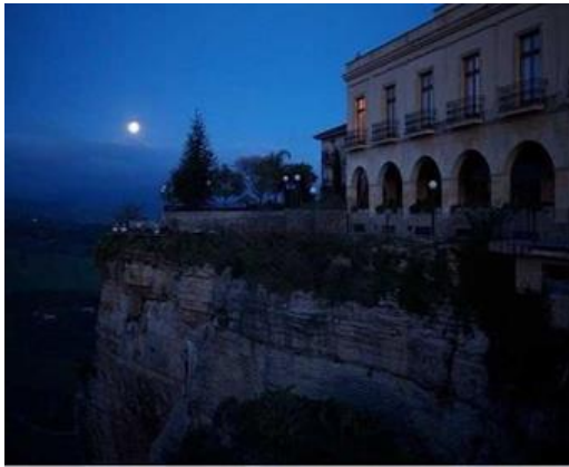
Figure 1. Input Image