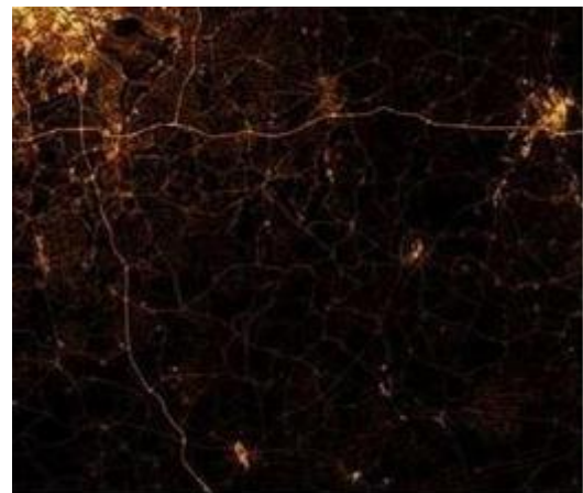
Figure 5. Input Image