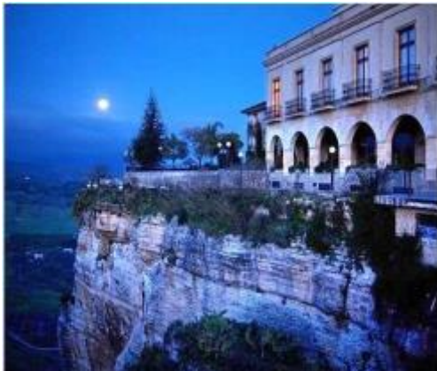
Figure 2. Enhanced Image