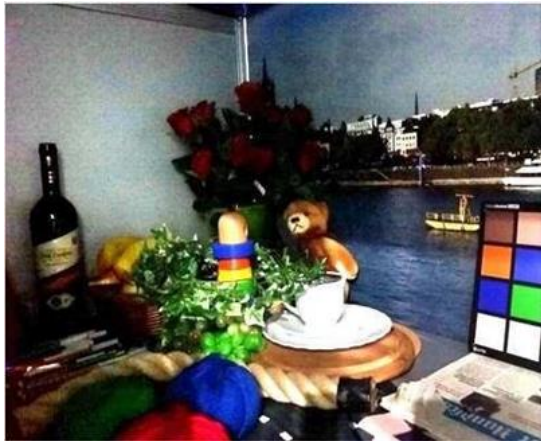
Figure 8. Enhanced Image