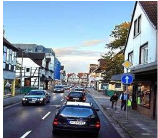
Figure 4. Enhanced Image