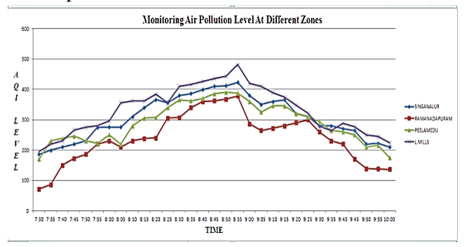
Figure 4: Comparison of AQI levels at various areas

We present this project for analysis the pollution less path for safer journey. We implemented in the Coimbatore city at first the sensor kit was placed in the singanallur area and absorb the air pollution level through it. According to the route map we find out three path to reach gandhipuram. The sensor kit placed in each area and the data value calculated for every 5mins.when the user select the particular path route to reach gandhipuram. It shows three alternative views and pollution value for each path. It also analysis and find the best path.