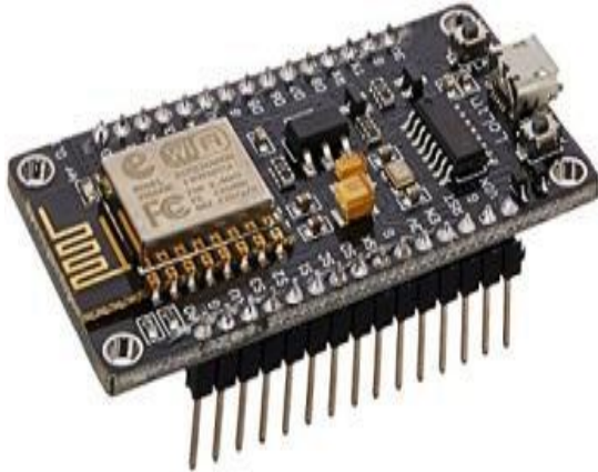
Fig: Wi-Fi module

The explanation "NodeMCU" marvelously talking proposes the firmware rather than the related development packs