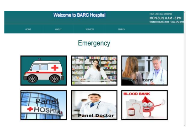
Figure 3. Emergency Services