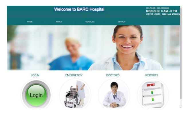
Figure 2:User Interface

But, in case the user is patient itself then the request further goes to application server that forwards it to the authentication server to validate the particular users identity by using their RFID and further sends it to the web server which is directly has connection to the database to fetch the dynamic information which has to be displayed on the user-interface (screen) that includes the appointment dates, availability of doctors patient's history, recent reports, their history, appointments dates etc. The employees have full access to the system where as visitor can only get the static pages access on the user-interface.